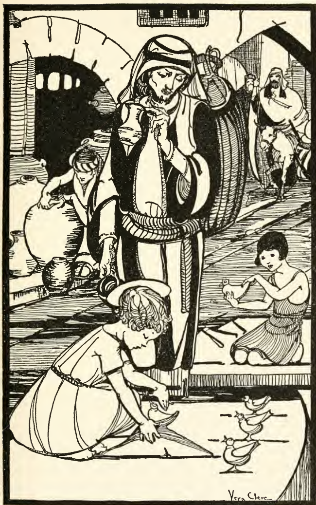
JESUS SAT ON THE DOORSTEP AND MADE CLAY CUCKOOS